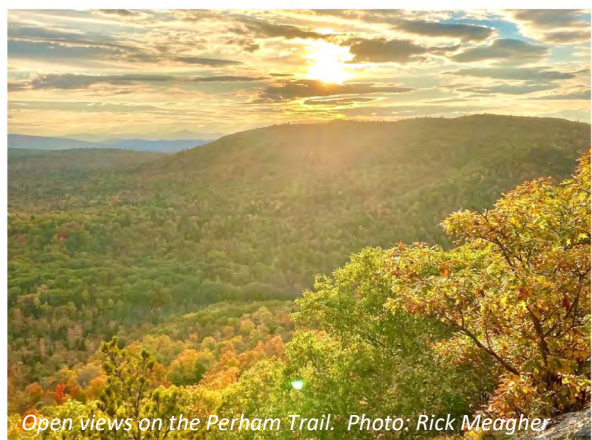
Open views on the Perham Trail.