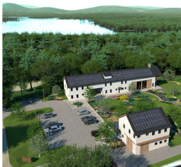
Rendering of the future facilities at the Roberts Farm Homestead site.

In August, WFLT received news that Governor Mills and the Northern Border Regional Commission (NBRC) awarded the Trust $89,842 via the State Economic & Infrastructure Development (SEID) grant program. With the funding provided we will demolish the old Roberts farmhouse, rehabilitate the surface and drainage of the warming hut parking area, and install the new entrance and parking at the future ecology center. Planning, survey, and engineering work is underway now, demolition will be undertaken during the winter, and the work on parking and circulation will be scheduled for summer of 2022. Thank you NBRC!