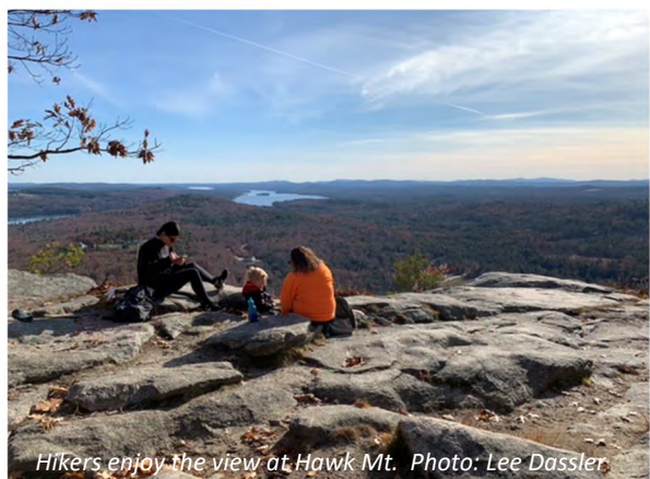
Hikers enjoy the view at Hawk Mt.