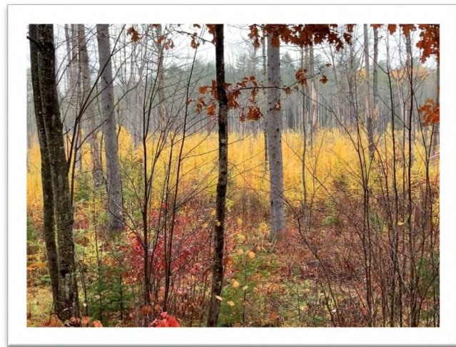
Tamaracks on the Ann Thurlow property in Oxford, November 2020

The purchase is part of an extraordinary regional conservation partnership that coalesced in 2019 when over 15,000 acres of the Chadbourne Tree Farm forestlands were listed for sale. The size, connectivity, and quality of these iconic working forests drew the interest of TFC, a national non-profit which works with public agencies and local land trust partners to conserve significant conservation lands. Since 1985, TCF has protected more than eight million acres of land across America, including 450,000 acres of working forests, coastal landscapes, and aquatic habitats in Maine.